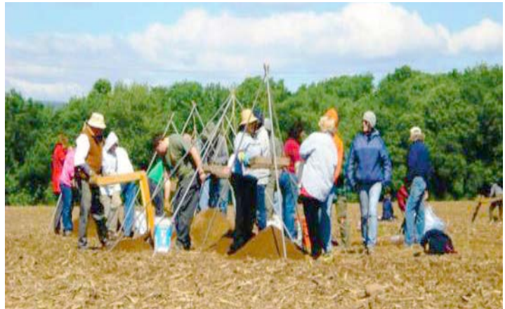
2013 Field Session in Maryland Archeology.

Stewardship Awards recognize outstanding effort and intent toward the maintenance and preservation of historic properties by individuals, businesses, organizations and government agencies of all types and sizes. These awards acknowledge the hard work, time, effort, money and dedication that are often required to maintain and preserve historically significant buildings and sites. Nominations do not need to be focused on a particular project, but rather should illuminate a history of care and commitment to preservation of historic properties.