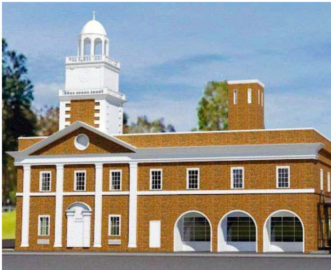
Cambridge City Hall Renovation - Excellence in Community Engagement, 2012