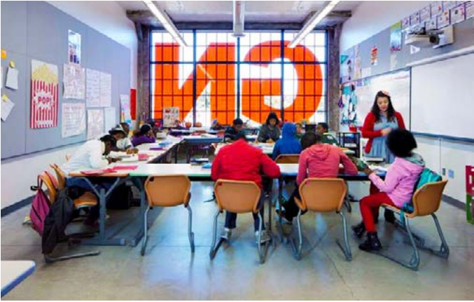
Baltimore Design School - Winner of 2015 Preservation Award for Project Excellence

The Maryland Preservation Awards, presented annually by the Board of Trustees of the Maryland Historical Trust, are the highest level of recognition for historic preservation, heritage education and community development projects in the state. Since 1975, the Maryland Historical Trust (MHT) has honored the outstanding preservation efforts of more than 250 individuals and projects throughout the state.