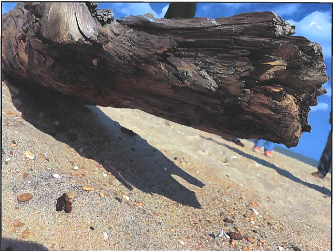
Beneath deteriorated end