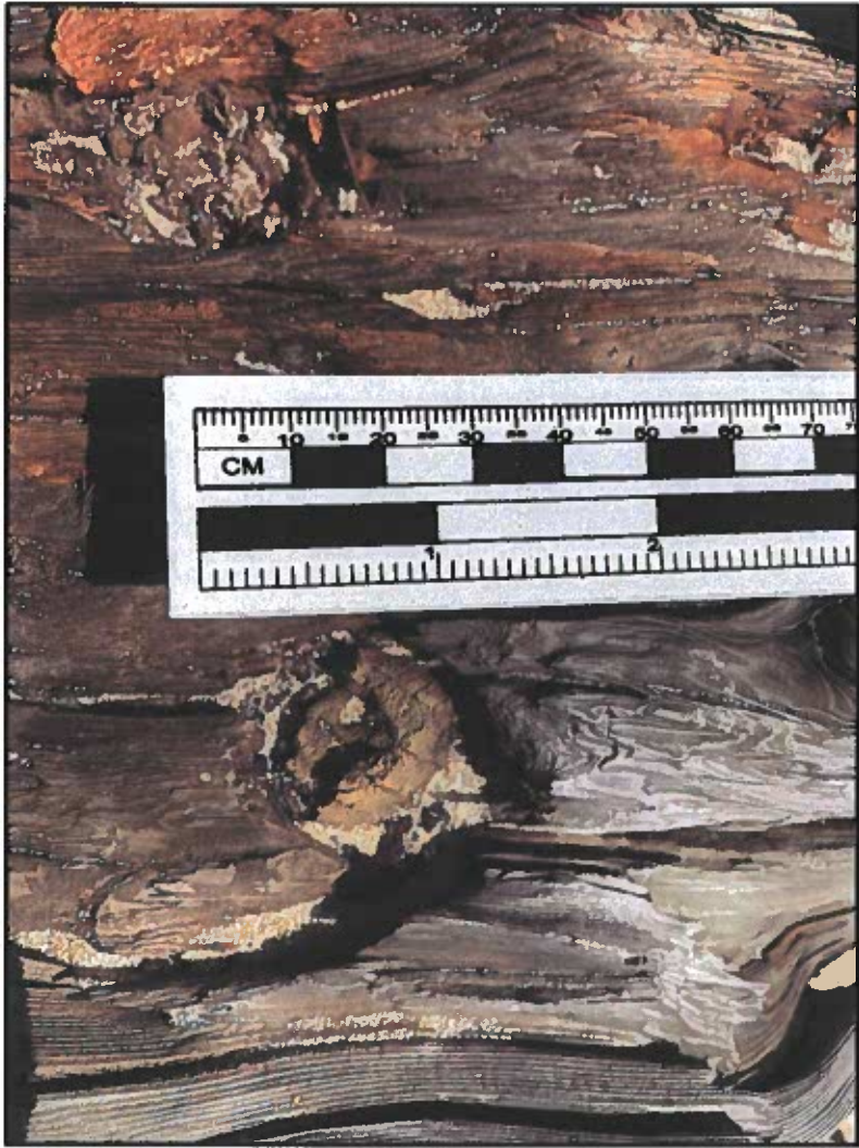
Details of treenails