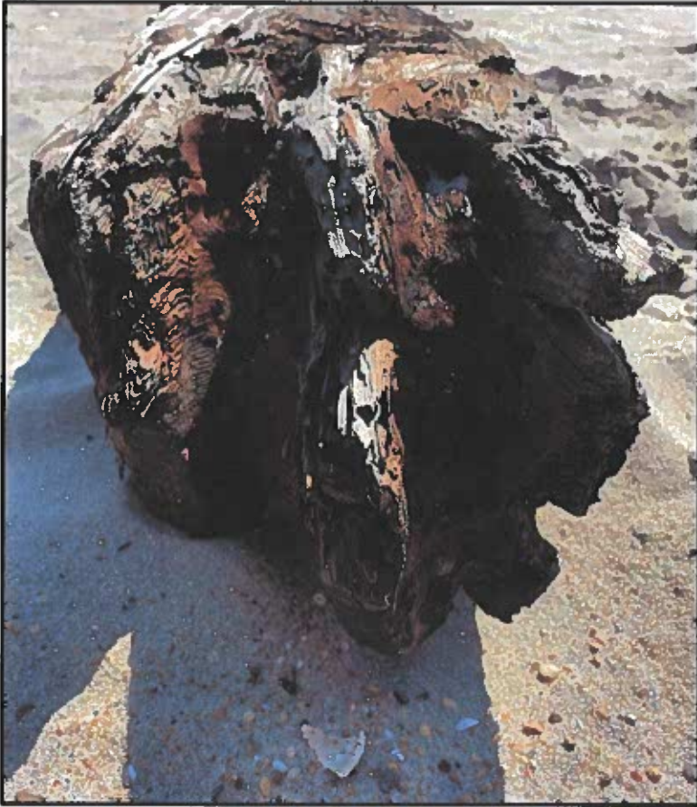
Opposite end to previous image (Left)