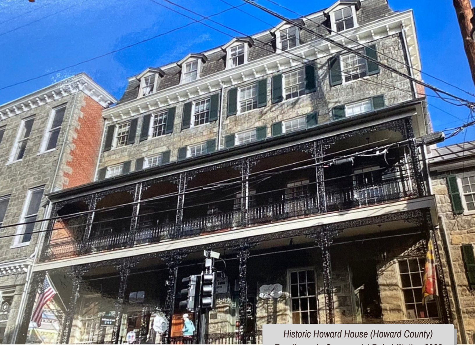
Historic Howard House (Howard County) Excellence in Commercial Rehabilitation 2023

The Maryland Preservation Awards, presented annually since 1975 by the Board of Trustees of the Maryland Historical Trust (MHT), are the highest level of recognition for historic preservation, heritage education, and community development projects in Maryland.