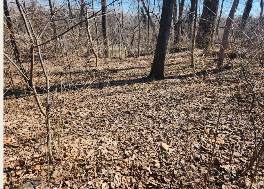
Catoctin Furnace African American Cemetery, Thurmont

Pro tip: Include information and photos of events or displays that show how your site shares its story and serves the community.