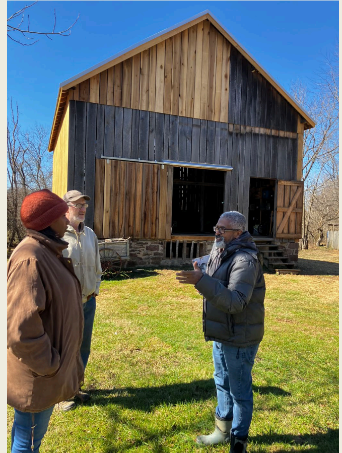
Button Farm Living History Center, Germantown