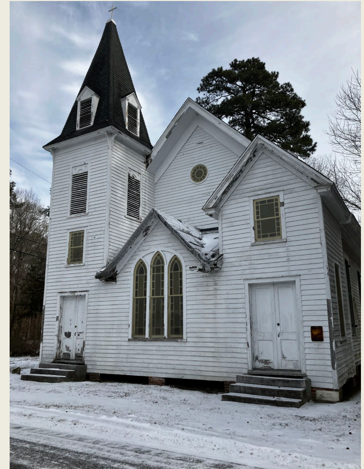
St. James ME Church, Oriole

FY26 AAHPP General Overview Webinar Slides