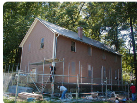
Sandy Spring Odd Fellows Lodge in Sandy Spring, Montgomery County.

The African American Heritage Preservation Program (AAHPP) provides grants to assist in the preservation of buildings, sites, or communities of historical and cultural importance to the African American experience in Maryland. The AAHPP is administered as a partnership between the Maryland Historical Trust and the Maryland Commission on African American History and Culture (MCAAHC) . The program typically receives an annual appropriation of $5,000,000 for grants per year. Applications for the AAHPP are typically available in early April and due July 1, with decisions made by December every year.