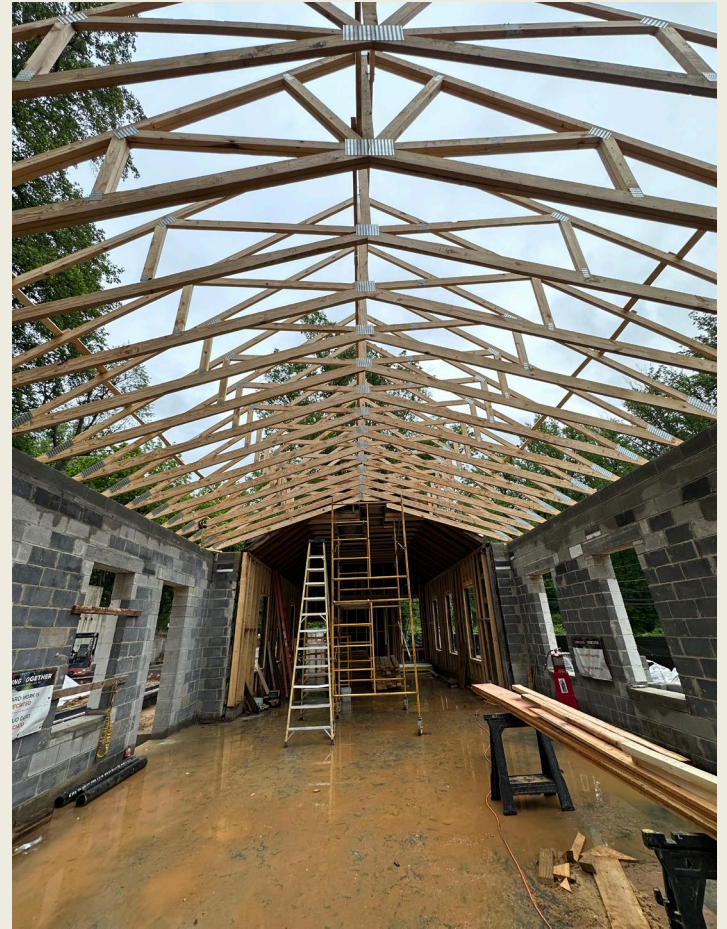
Scotland AME, Rockville

Pro-Tip: Attach project-related documents from professionals to your application.