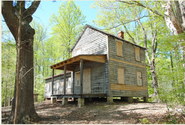
George Rice House, Prince Frederick