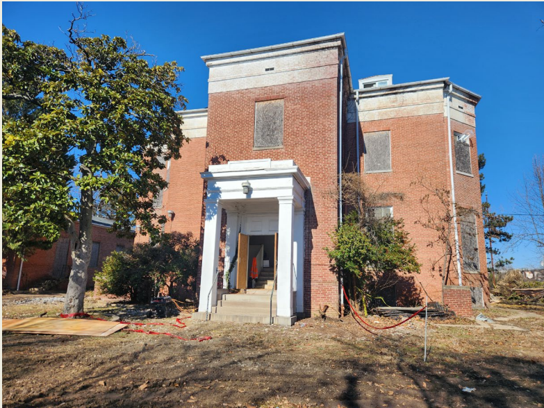
Upton Mansion, Baltimore City