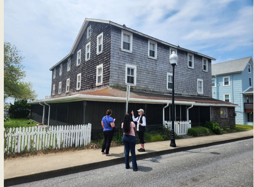
Henry Hotel, Ocean City

Pro Tip: Don't forget to include pre-development costs like building conditions assessments, architectural drawings, and ground penetrating radar.