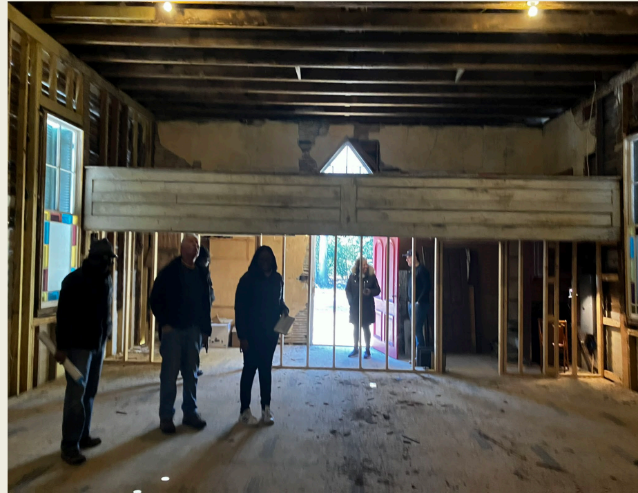
St. Paul Church, Denton

Pro tip: If your requesting funds for new construction, make the case as to how the new building will meet an urgent community need.