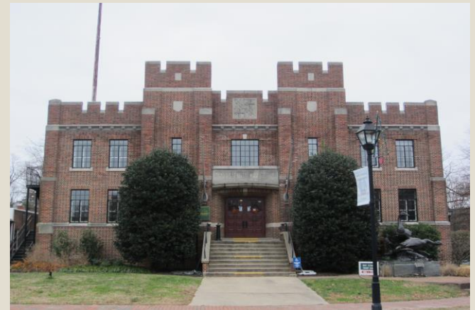
Easton Armory, Talbot County