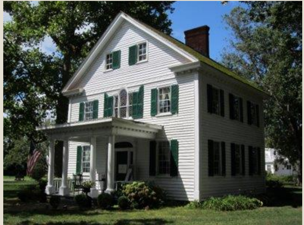
Calvin B. Taylor House, Worcester County