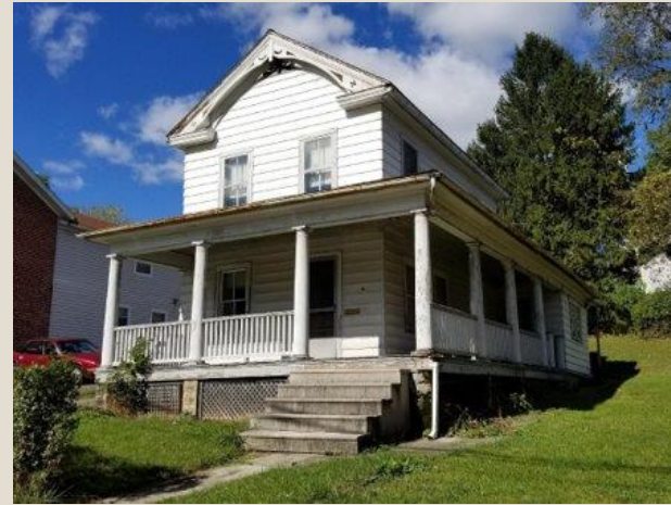
Jane Gates Heritage House, Allegany County: Context Photo