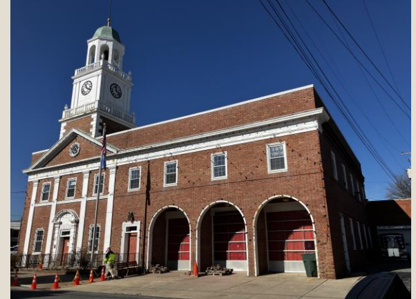
Cambridge Municipal Building Clock Tower