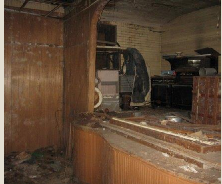
Sandy Spring Odd Fellows Lodge, Montgomery County