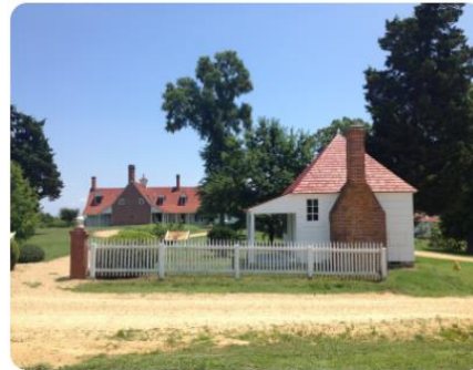
Sotterley Plantation gatehouse project.