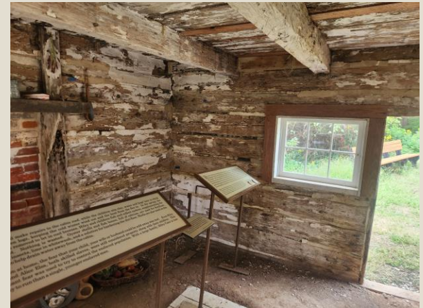
Sotterly Plantation, Enslaved Quarters