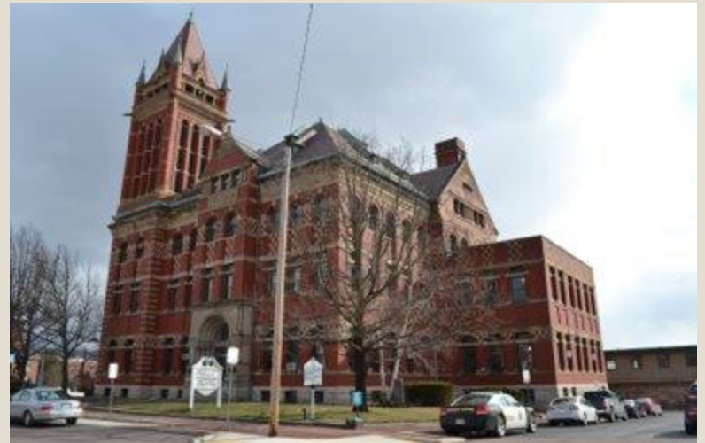
Allegheny County Courthouse, Allegheny County