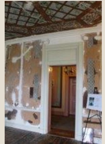
Clifton Mansion, Baltimore City + Hammond-Harwood House, Anne Arundel County

Pro Tip: Discuss the Secretary of the Interior's Standards and in-kind rehabilitation!