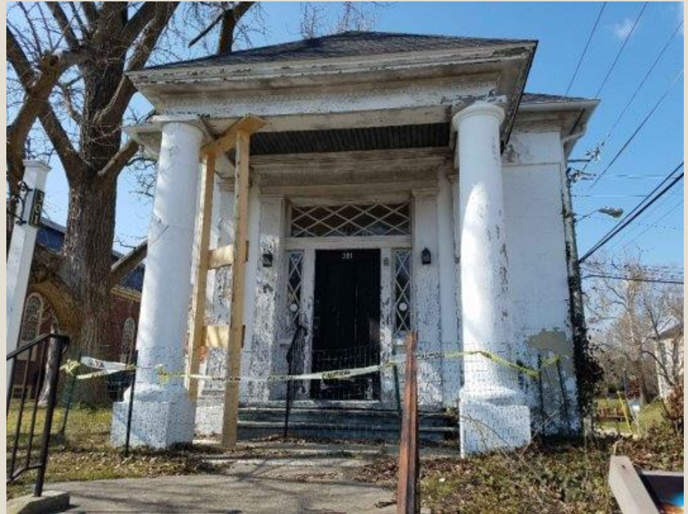
Wallace Office Building, Dorchester County