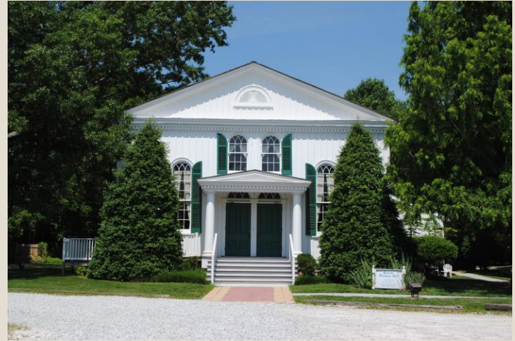
Baldwin Hall, Anne Arundel County

Pro Tip: Do not attach your MIHP form or NRHP form!