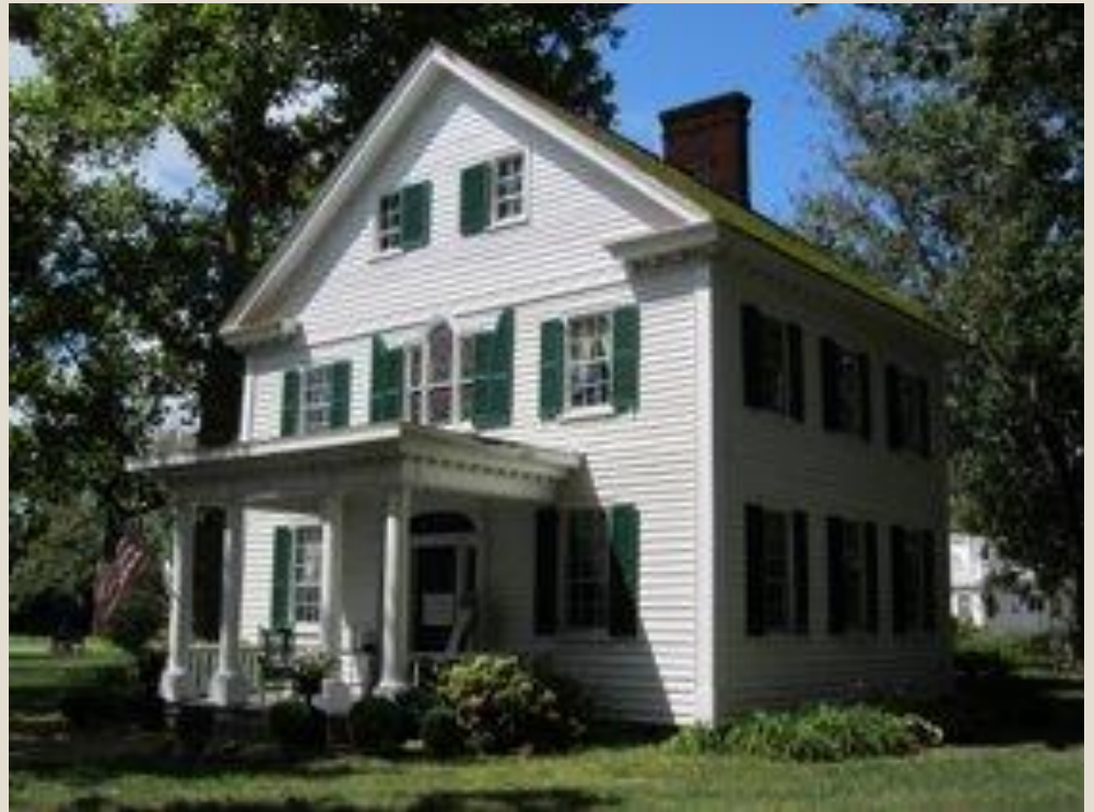
Calvin B. Taylor House, Worcester County

The easement runs with the land . Present and future owners are bound by the easement requirements for the length of the term easement.