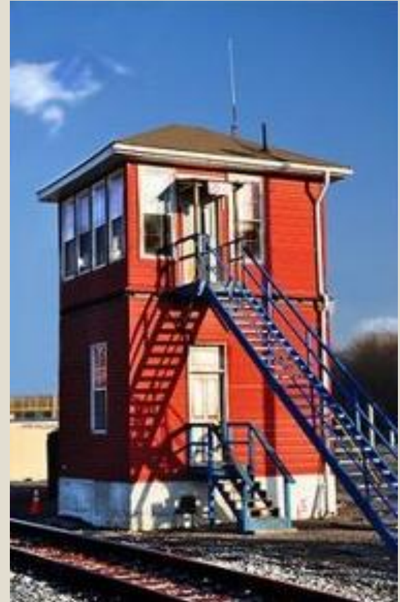
B&O WB Tower, Frederick County