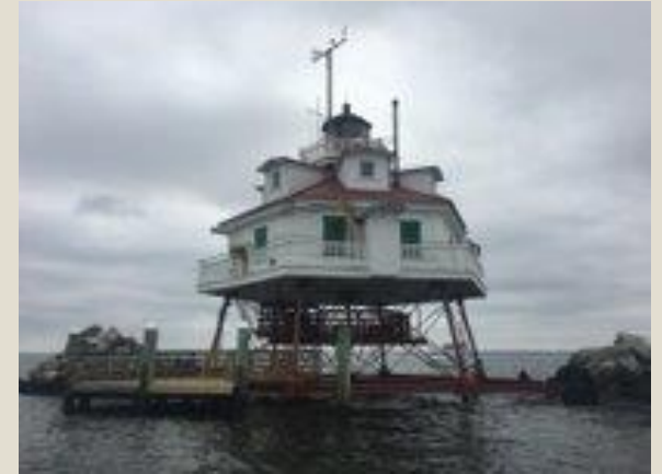
Thomas Point Shoal Lighthouse, Anne Arundel County

Historic Preservation Capital Grant Program requires conveyance of an easement.