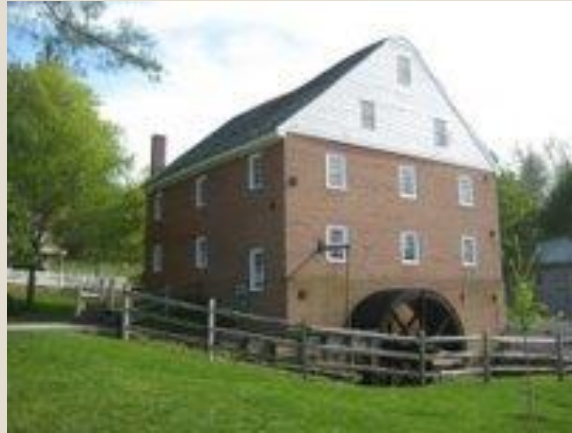
Union Mills Homestead, Shriver Grist Mill Flume, Carroll County