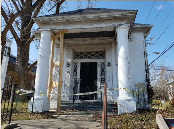
Wallace Office Building, Dorchester County