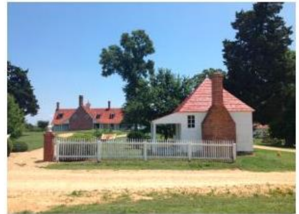
Sotterley Plantation gatehouse project.

The Historic Preservation Capital Grant Program promotes the acquisition, restoration, and rehabilitation of historic properties in Maryland. Eligible properties are limited to those which are listed in or determined eligible for the National Register of Historic Places, either individually or as a contributing structure within a district. The program typically receives an annual appropriation of $600,000 for grants per year.