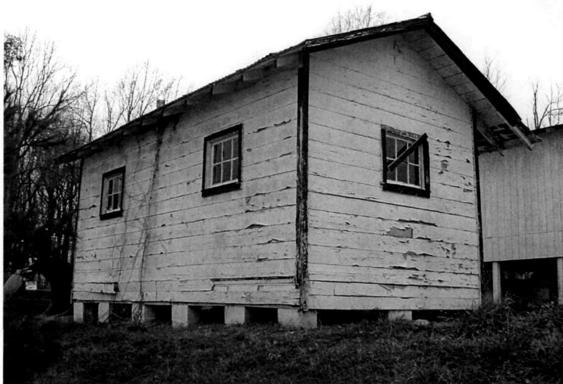
Sunderland Polling House