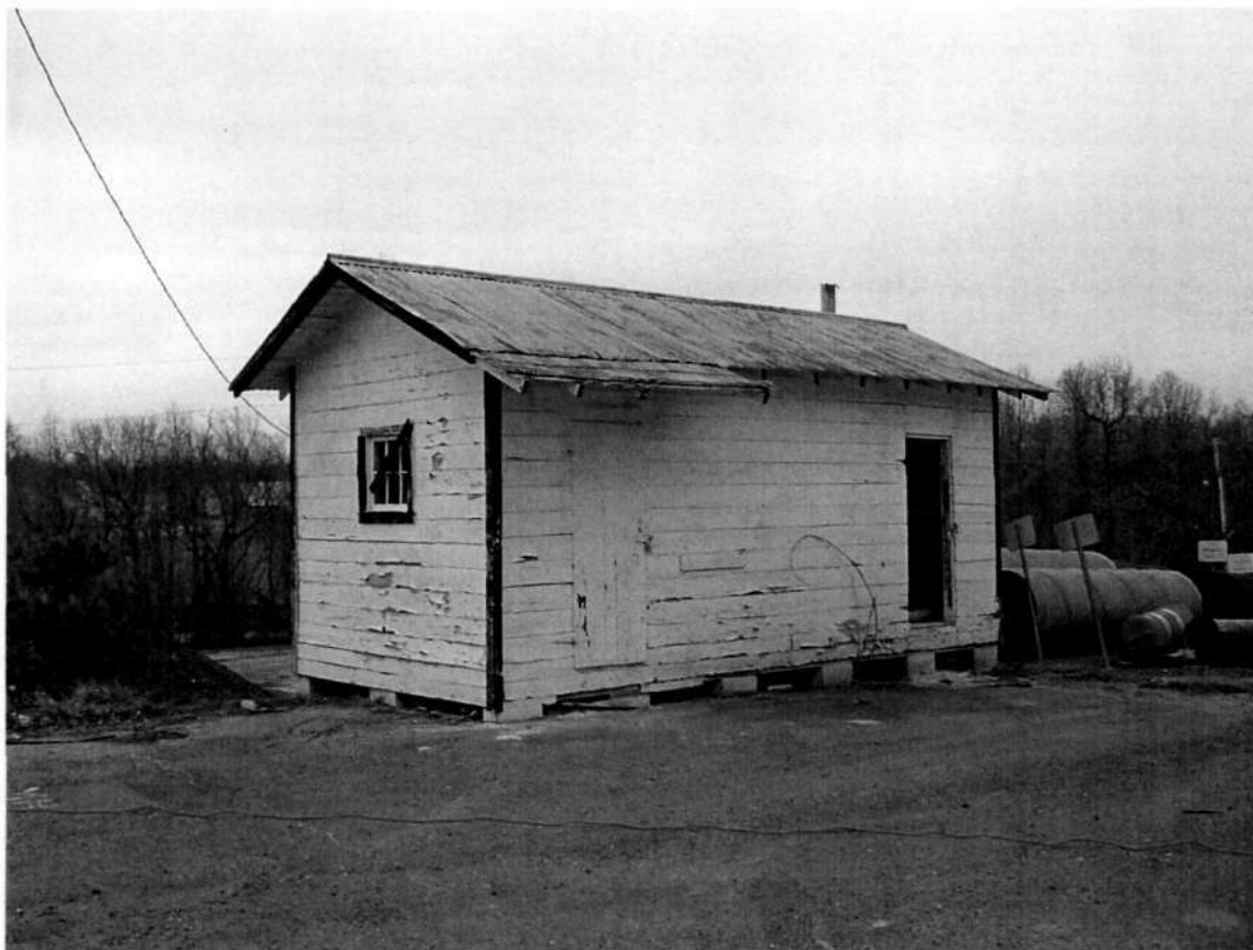
Sunderland Polling House