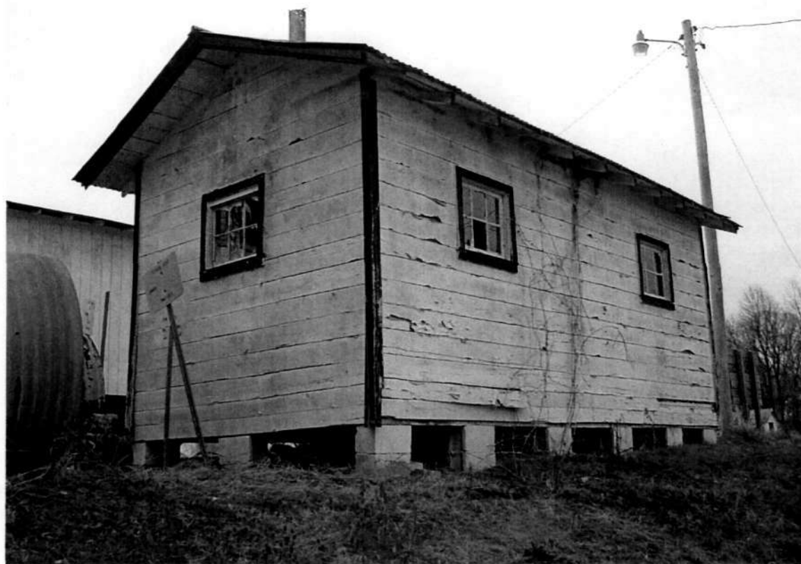
Sunderland Polling House