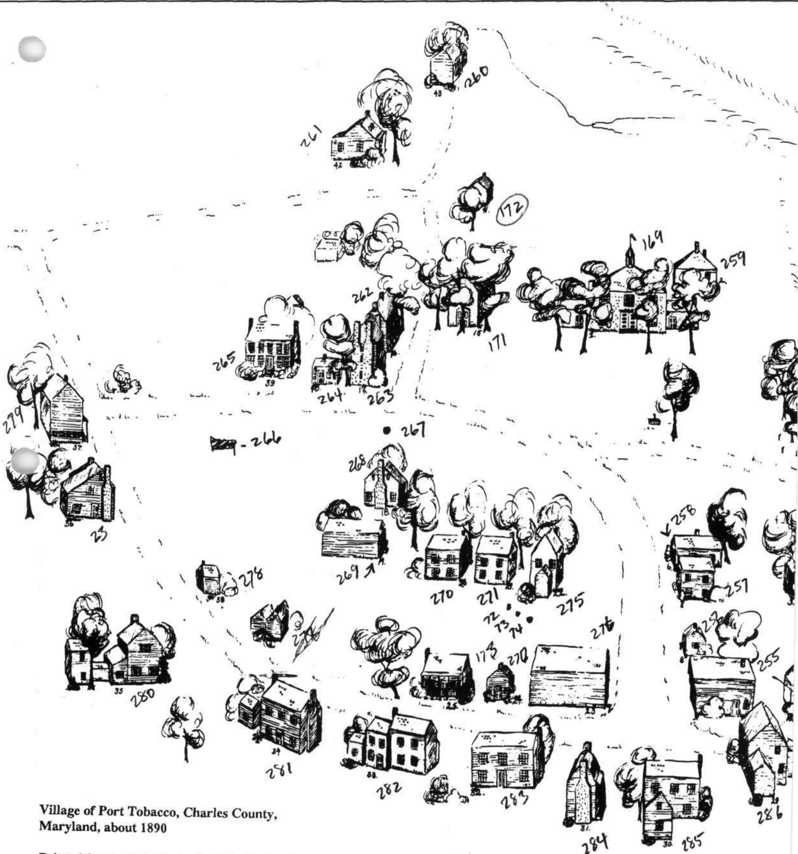
Village of Port Tobacco, Charles County, Maryland, about 1890

Printed for and Distributed by The Society for the Restoration of Port Tobacco, Inc.