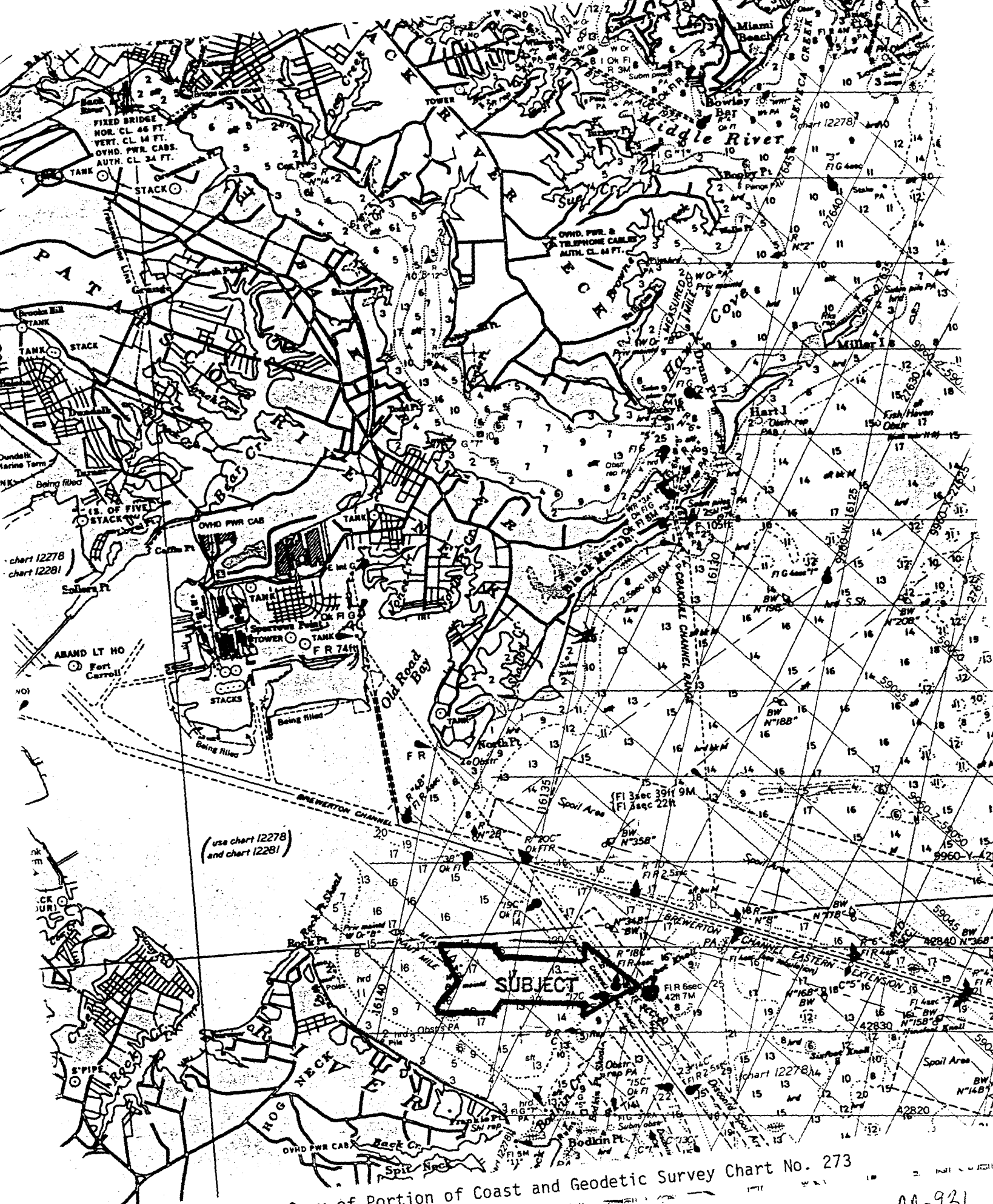
Copy of Portion of Coast and Geodetic Survey Chart No. 273