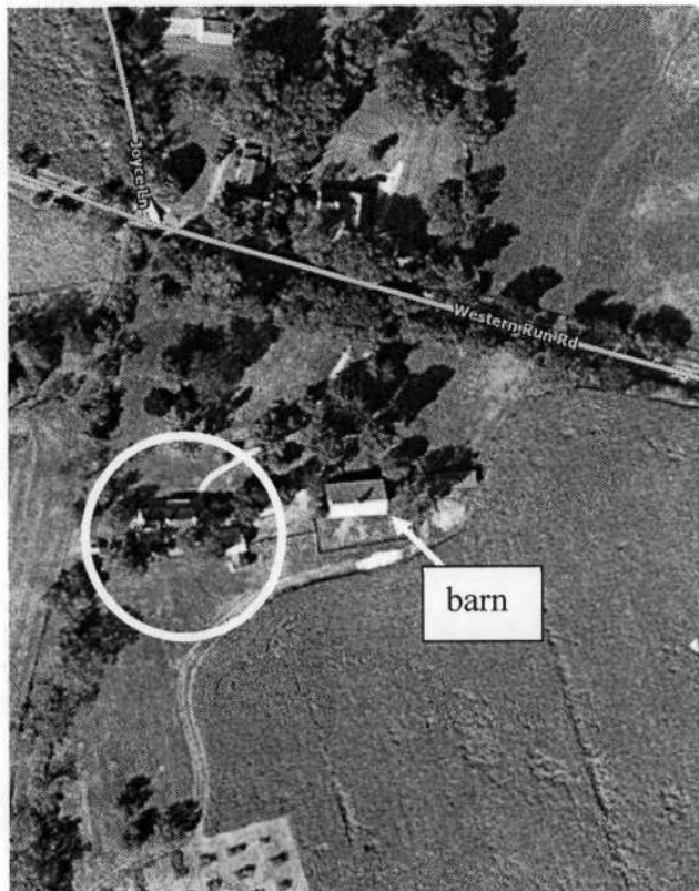
Tax Map 33, p. 188