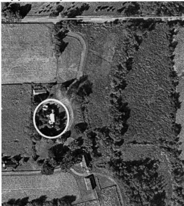
Tax Map 33, p. 189