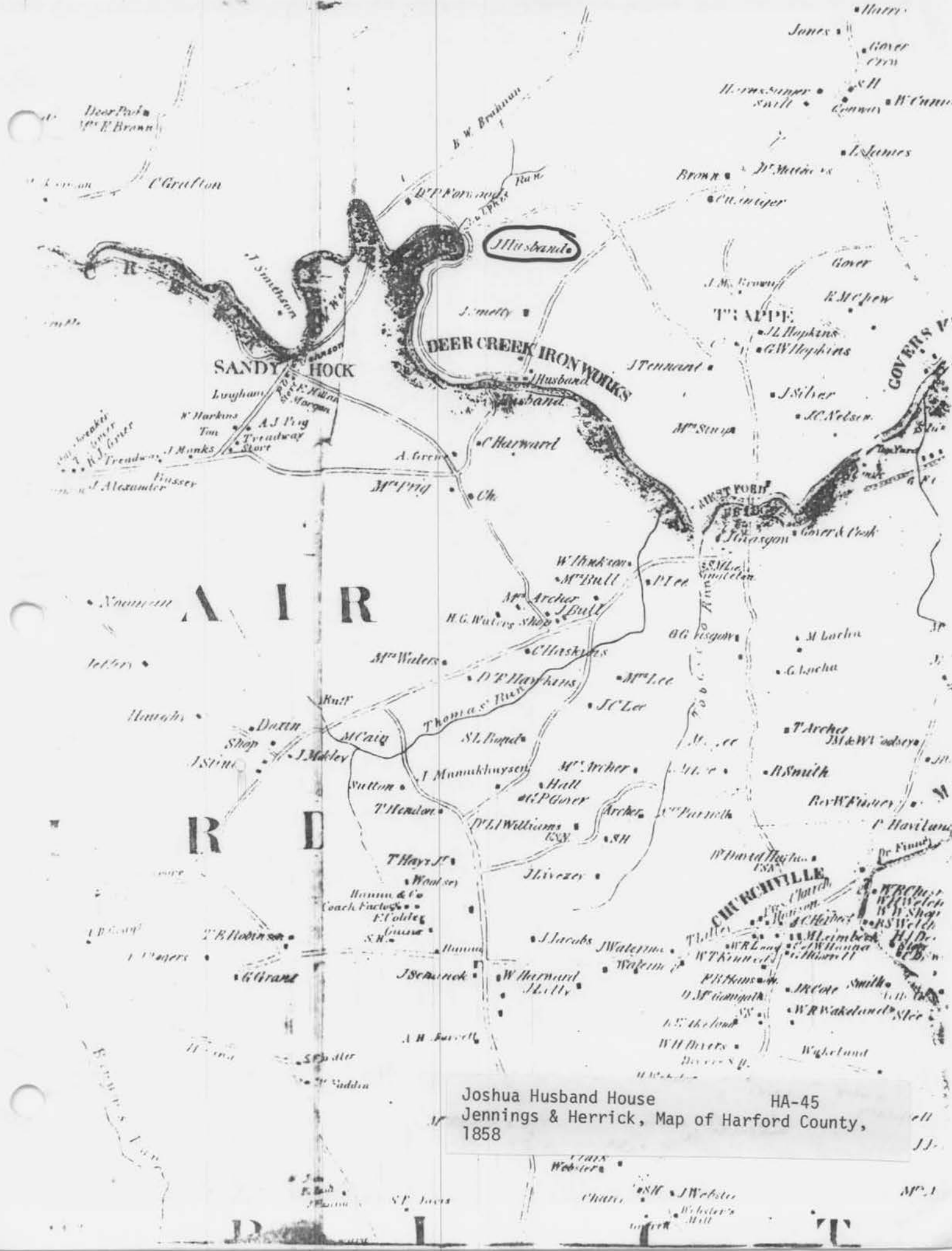
Joshua Husband House Jennings & Herrick, Map of Harford County, 1858