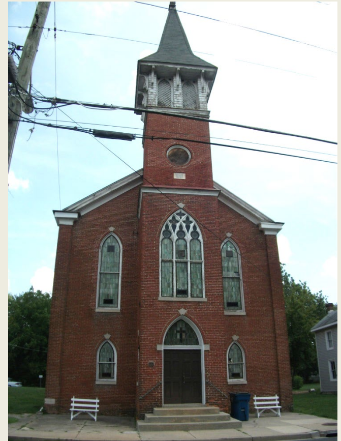
Asbury M.E. Church, Easton