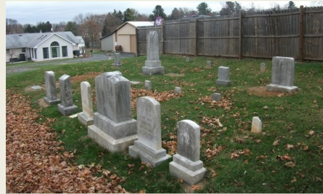
Tolson's Chapel, Sharpsburg