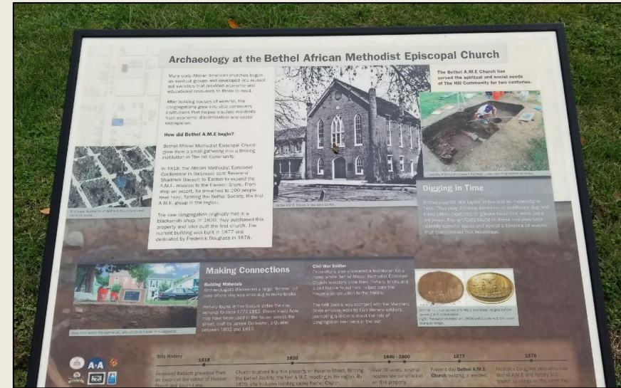
Bethel A.M.E. Church, Easton